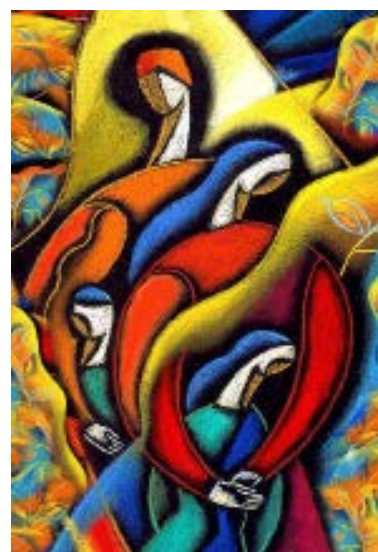
Harmony by Leon Zernitsky, Russia

Sarah Bachelard, “The Harvest of the Heart’s Work (Ecclesiastes 3:1-8),” March 26, 2022 — read the complete reflection at: https://benedictus.com.au/wp-content/uploads/2022/03/The-Harvest-of-the-Hearts-Work-260322.pdf