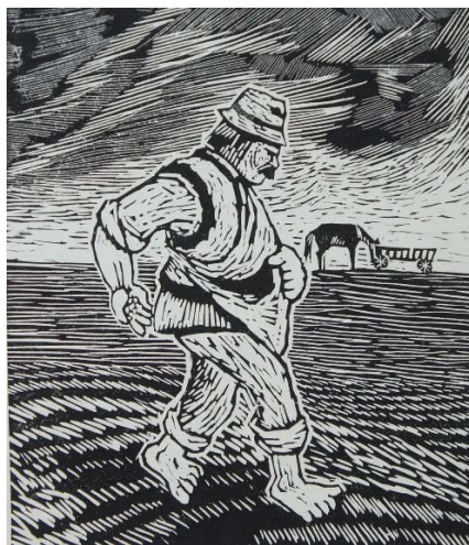
Above: barefoot farmer sowing seeds in a wheat field

if Jesus himself be our leader we shall walk through the valley in peace